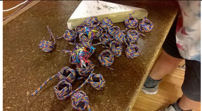
The Products: Well Some are better than others but on the whole it looks like quality control is doing its job.