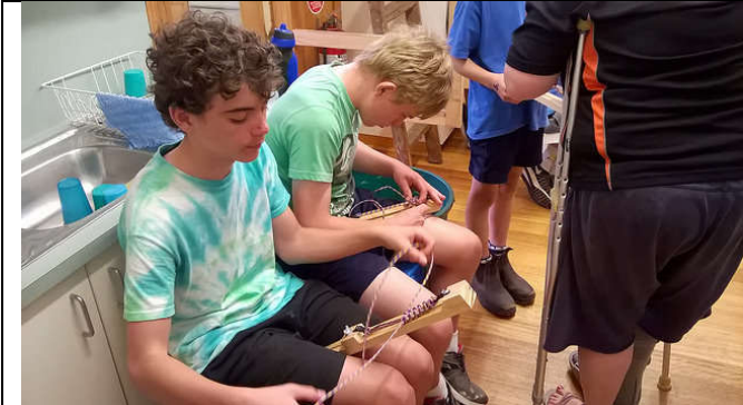
Scruffie is against Child labour in principle. But when we have parental consent and its for a good cause ...