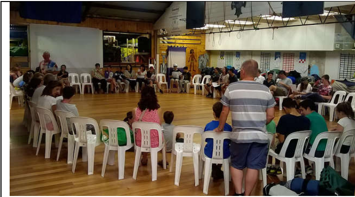
Invisible round table - Sometimes we need to communicate. One way is to all talk at once. Another is to use structure to enable Conversation . ...Like King Arthur.