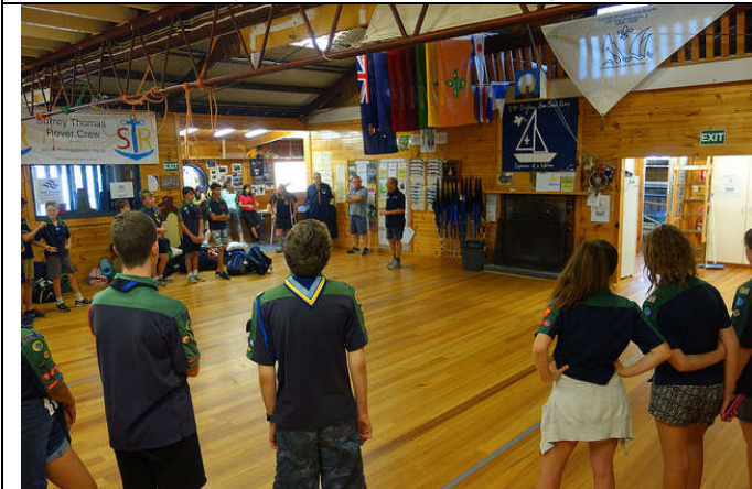
Parade : This is a time when scouts keep quiet and listen attentively. Examples within the photo show how naughty scouts MAY in some circumstances break this rule.