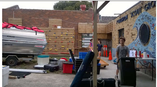
Operations: We need to operate. Someone has to.