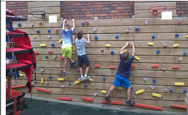
Scruffie instructs your members on Technique.